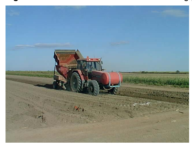
Figure 1: GUANO® / REEFSAFE® rows being planted.

The field was planted with a conventional cane billet planter, as shown in Figure 1.