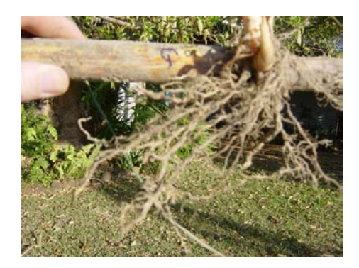
GUANO® / REEFSAFE® treatment